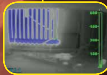
Electronic Thermal Throttle